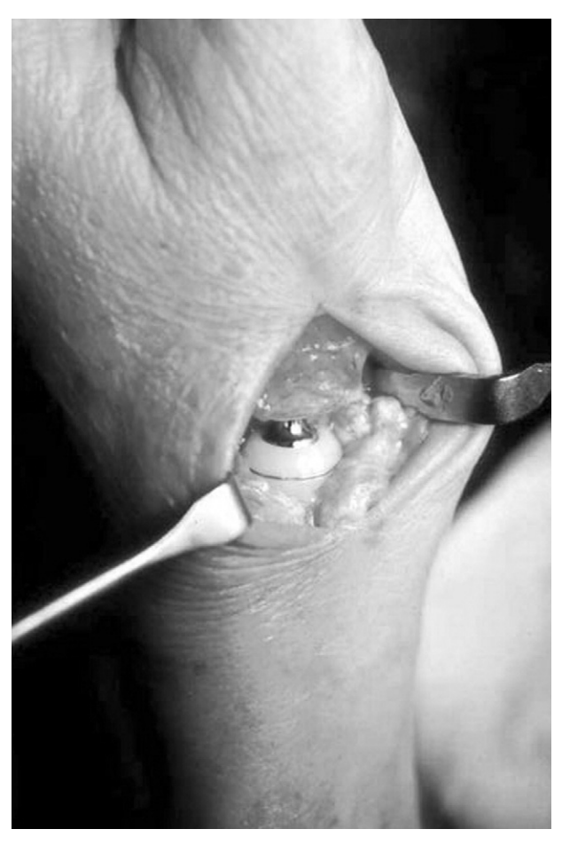
Figure 4. Reduction of both components is followed by testing for stability and impingement of the prosthesis.

ate cup migration, stem subsidence, zones of osteolysis, and joint subluxation as defined by Wachtl et al. 83,90