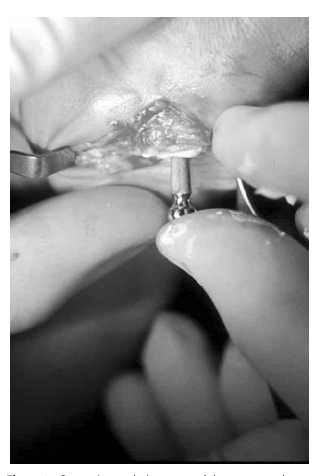
Figure 3. Cementing and placement of the metacarpal stem in the medullary canal are performed.

Posteroanterior and lateral radiographs were obtained at the final follow-up evaluations to evalu-