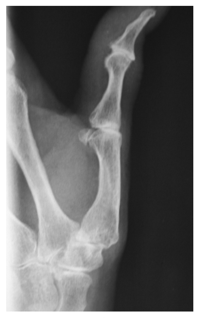
Figure 1. Radiographic study from the left thumb of a 67year-old woman showing complete loss of trapeziometacarpal joint space, subluxation, osteophytes, and subchondral cysts. Total cemented arthroplasty was performed in this patient.

plained of diffuse pain about the thumb basal joint (visual analog scale score, 8 to 9 out of a total of 10) and decreased lateral pinch strength and grip strength. One patient had severe loss of the first web space. Patients experienced symptoms an average of 3 years (range, 1-4 y) before surgery. Positive physical findings included a grind test in all patients. Consistent preoperative radiographic findings were dorsal metacarpal subluxation, the presence of prominent marginal osteophytes on the ulnar border of the distal trapezium, joint space narrowing, cystic changes, and sclerotic bone (Fig. 1). No patients had severe flattening or loss of trapezial height of the trapezium, which would preclude the use of a CMC implant.