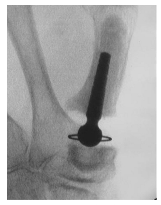
Figure 5. Fluoroscopic views are obtained to assess proper cementing and correct implant positioning.

Survival analysis. There was only 1 revision (96%) survival) in our series, performed in a woman who fell after the primary replacement and dislocated the components. Closed reduction was obtained, and a thumb spica splint was used. Even though the patient's ROM continued improving she had mild discomfort, and 3 years after the original procedure she had revision surgery using the same type of prosthesis for posttraumatic loosening. At the final follow-up examination (5 years), she did not have any