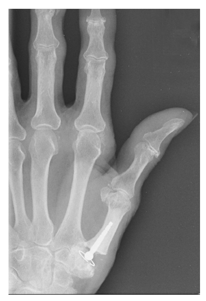
Figure 6. Radiographic study at the final follow-up examination with no signs of implant loosening.

pain and radiographic findings were the same as for patients who did not have revision surgery.