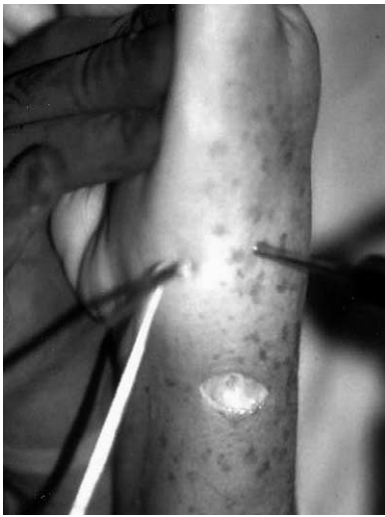
Figure 4. Basal joint arthroscopic procedure in the patient showing insertion of the interposition graft using a slip of the abductor pollicis longus.

joint space to perform the interposition arthroplasty and making the surface bleed to enhance the formation of adhesions to the tendon graft. Once this was completed we made a transverse incision over the dorsoradial aspect of the CMC joint, the radial sensory nerve was identified and protected, and we proceeded to open the first extensor compartment. We then identified the volar-most abductor pollicis longus tendon slip and released it from near its insertion. With the use of a small tendon stripper we extracted the tendon slip that now would be used for a tendon graft. We then placed the arthroscope back into the joint. With arthroscopic assistance we inserted the tendon graft between the metacarpal base and the lightly debrided trapezium (Fig. 4). Once the graft was in place, we noted that it filled the joint space nearly completely and the portal was closed with a polyglactin 910 deep suture (4-0 Vycril Rapide; Ethicon, Stollingen, Germany) stitch to avoid tendon extravasation. A short-arm thumb spica splint was placed and after 1 week the splint was changed for a short thumb spica cast for another 3 weeks.