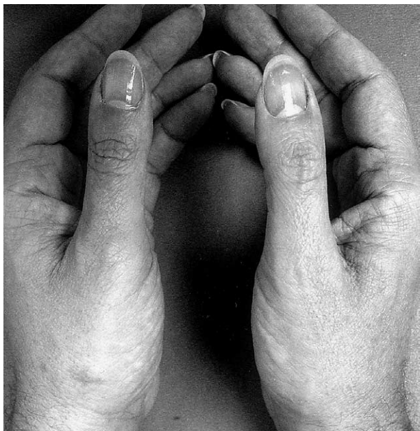
Figure 6. Late postoperative view of the thumbs showing the left thumb at 4 months after surgery and the right thumb at 1 year after arthroscopic interposition arthroplasty.

articular surfaces. 5,6 Fusion of this joint, however, entails not only marked limitation of thumb motion but also the ability to lay the hand flat on a surface. The long-term success rates for thumb CMC tendon interposition arthroplasty have been encouraging. 15-17 In view of the fact that our resection arthroplasty was successful it is likely that other resection arthroplasties also would be successful.