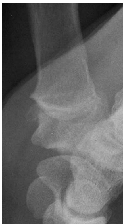
Figure 2. Preoperative radiographic study showing marginal osteophyte and bone-to-bone contact in stage III osteoarthritis.

Based on these findings the patient appeared to have bilateral, late stage III basal joint arthritis (according to Eaton's classification) 5,10 secondary to Ehlers-Danlos syndrome. Arthroscopy of the right CMC joint was performed under wrist block regional anesthesia with tourniquet control. A single Chinese finger trap was used on the thumb with 2.3 kgf of longitudinal traction. The CMC joint then was detected by palpation. The incision for the 1-R (radial) portal was placed just volar to the abductor pollicis longus tendon. The incision for the 1-U (ulnar) portal tendon was performed just ulnar to the extensor pollicis brevis tendon. Joint distension was achieved by injecting 1 mL of normal saline and we used a short-barrel 1.9-mm 30°-inclination arthroscope. Joint evaluation revealed extensive synovitis and advanced osteoarthritis with extensive cartilage loss (Fig. 3). Therefore the decision was made to proceed with arthroscopic tendon interposition arthroplasty by using a slip of the abductor pollicis longus tendon because of the bilateral absence of the palmaris lon-