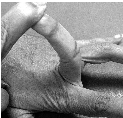
Figure 1. Ligamentous laxity shown in a patient with Ehlers-Danlos syndrome.

90°, passively oppose the thumb to the volar aspect of the forearm, hyperextend the elbow beyond 10°, hyperextend the knee beyond 10°, and forward flex the trunk until his palms could rest easily on the floor (Fig. 1). The grind test was positive on both joints. Pinch strength testing showed a right-sided deficit with a value of 7.3 kgf compared with 9.1 kgf on the left, nondominant side. Radiographs showed evidence that the bilateral basal joint subluxation was more pronounced on the right hand and narrowing of the joint space and some early marginal osteophytes (Fig. 2). Subchondral sclerosis also was evident, with no cyst being present.