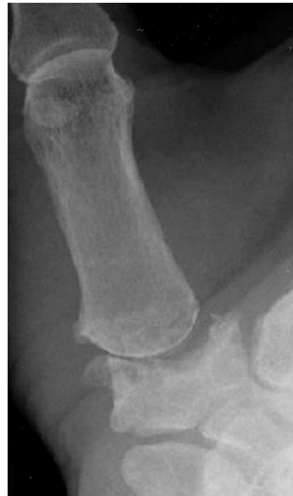
Figure 5. Postoperative radiograph showing the arthroplasty appearance with the newly created joint space.

Some investigators have proposed the use of arthrodesis of this joint in patients with Ehlers-Danlos syndrome to eliminate the joint laxity issue, thus preventing progressive degenerative changes on the